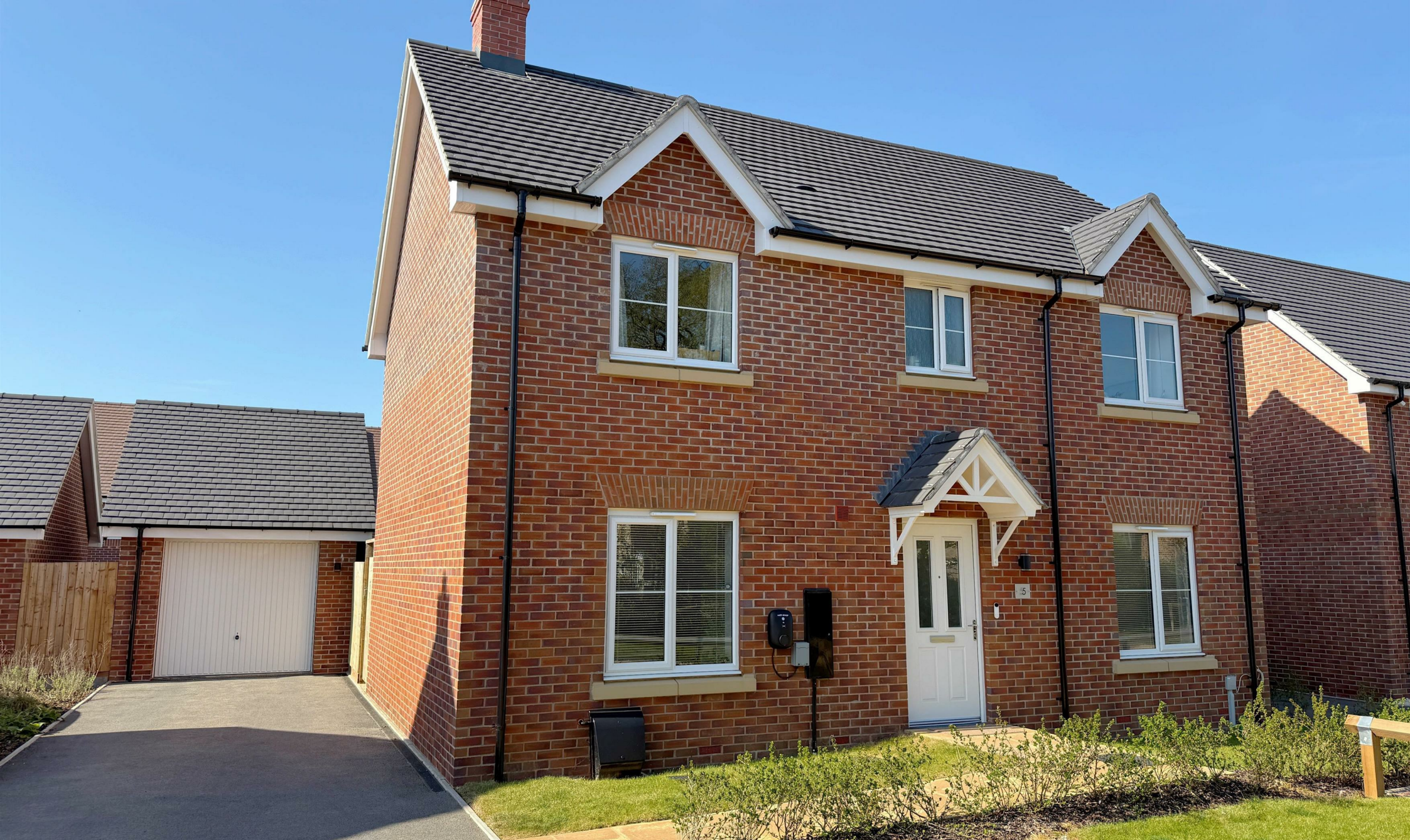
Pippin Place , Stratford upon Avon, CV37 9ZS